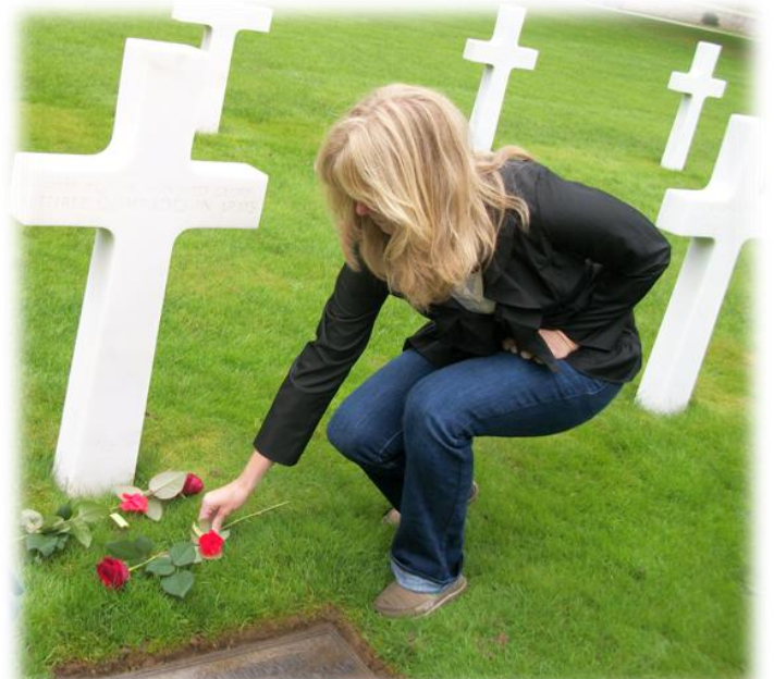
The grave of 3 members of the crew of the B 26 Marauder "The Yankee Guerrilla"