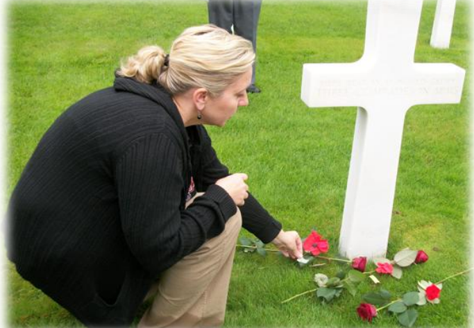
The Duty of Memory !