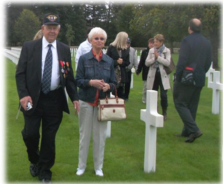
The visit of the fallen comrades