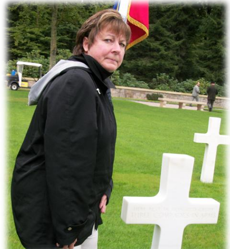
...an American soldier, known but to God...