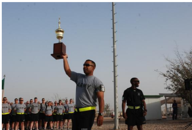
2010 1-10 FA Commander's Cup Champions.

The Commander's events entailed tug of war and a true fitness test. Each of the participating units was to give up 4 personnel for the final 3 events, pushups, sit-ups and a run. Although the structure was set like a normal Army Physical Fitness Test (APFT), this was no ordinary PT test. Each unit was given 3 minutes for push-ups and sit-ups, where they had to do as many as possible as a tag-team. This was a true test of their unit's readiness after eleven hours since the beginning of the Commander's Cup competition. The cup's last and final event was a 4 man relay race with approximately half of a mile each way carrying the units' respective guidons.