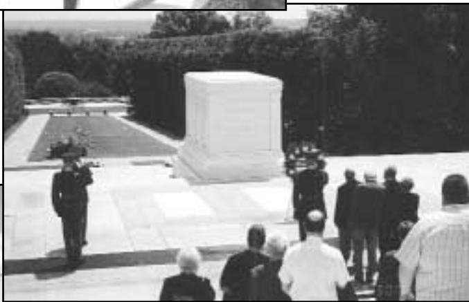
OP 7 at the Tomb of the Unknown Soldiers, Memorial Day 2002.