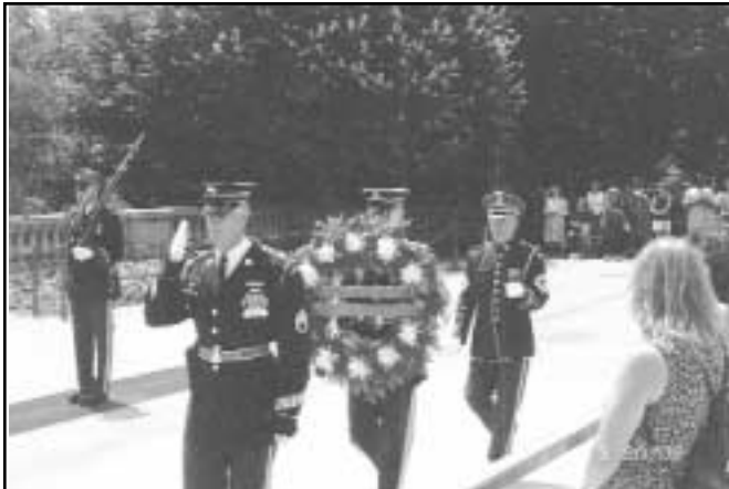
Preparing to place the Third Inf. Div. Wreath at the Tomb of the Unknowns, Memorial Day 2002.