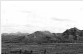
Jackson Heights in the Spring of 1953.