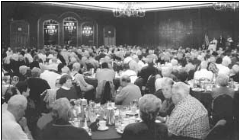
Over 400 members and guests of The Society of the Third Infantry Division gathered Sunday September 15th, 2002 for the Memorial Breakfast.