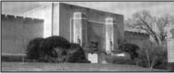
Geogr C. Marshall Foundation Post Office Drawer 1600 Lexington, VA 24450-1600

I would like to make you aware of the George C. Marshall Foundation's World War II-Korean War Memories Project. As Tom Brokaw recently reminded us in his best-seller about that generation, their stories of sacrifice and courage have made a lasting impression on the American public. When he began to collect those stories, he concluded that this was the "greatest generation."