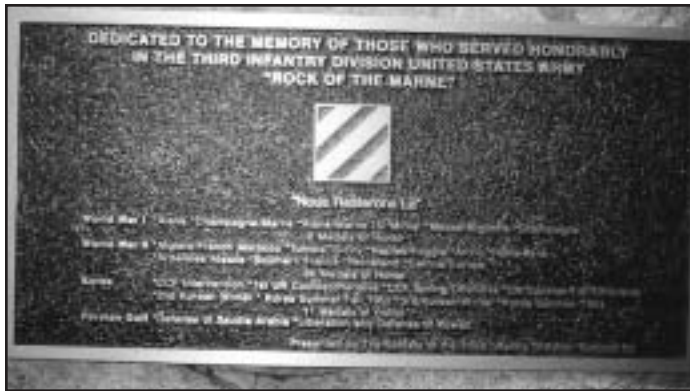
Plaque on the Wall of Honor at Riverside National Cemetery, Riverside, CA.