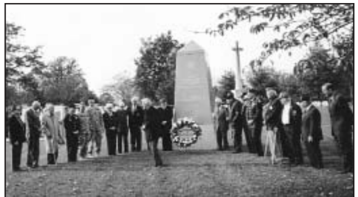
Members of OP7 lay wreath at 3rd Infantry Division monument.

Fort Myer for a luncheon meeting followed by formal wreath laying ceremonies in Arlington National Cemetery.