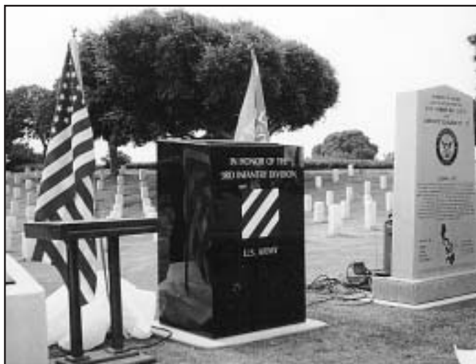
Members of OP22 installed the above monument in Fort Rosecrans National Cemetery, San Diego, CA.

It was also suggested that to facilitate the installation of another Monument to our glorious Third Infantry Division at what is being called the Arlington of the West, viz. Riverside National Cemetery, that we ask for contributions from the other National Outposts throughout the country. As you can see from the photographs the large granite monument we installed in Fort Rosecrans National Cemetery in San Diego, the same type of monument we installed in the Los Angeles National Cemetery, both monuments are surmounted with the plaque photograph shown. At the present time we have just the plaque displayed on the Wall of Honor at Riverside National Cemetery. We have almost $6000.00 saved towards the cost of installing a monument similar to the Fort