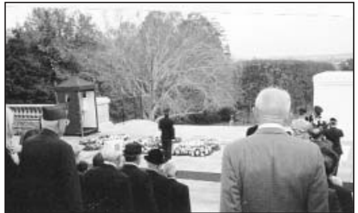
OP 7 members at 'laying of the Wreath' ceremony at the Tomb of the Unknown Soldier, Arlington National Cemetery, Veterans Day, 2004

The members of Outpost 7 continued their tradition of honoring our fallen comrades by conducting impressive wreath laying ceremonies at Arlington National Cemetery on Veterans Day, November 11. Forty-nine Rock of the Marne Veterans from OP 7 assembled at