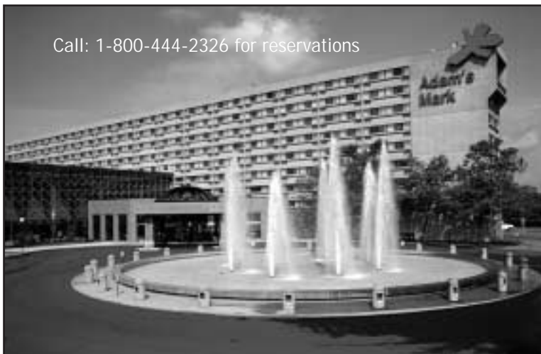
Call: 1-800-444-2326 for reservations